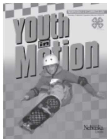
Cover designs by Communications & Information Technology

YOUth in Motion teaches youth to set fitness goals through lessons in stretching and exercising, resting, healthy snacking, and reading food labels. 4-H'ers who use YOUth in Motion can work with their families to set physical fitness goals.